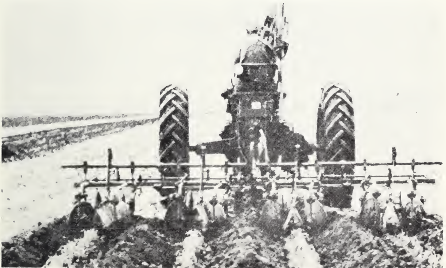
Figure 2. —A corn cultivator throwing dirt away from the young plants in the first cultivation. In the next cultivation it will throw dirt the other way and cover weeds in the row.

Cultivate shallow and only as often as necessary to control weeds. Deep and too frequent cultivation can seriously damage the roots. Root lodging may be reduced if the soil is mounded around the crowns, particularly at the last cultivation.